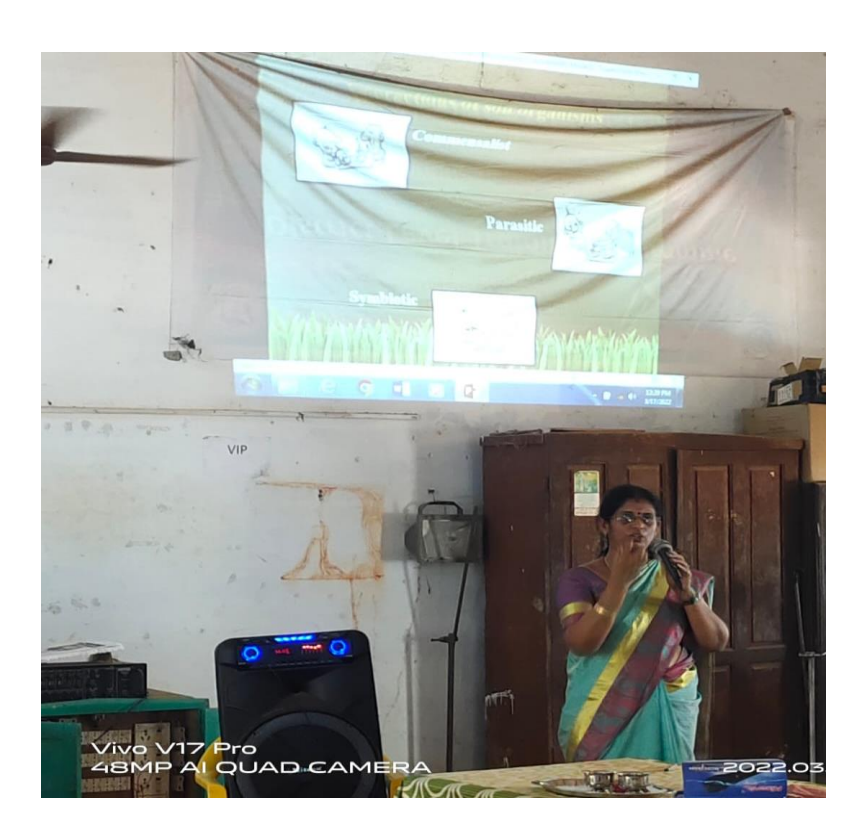
VILLAGE EXTENSION PROGRAMME (VEP), KANDADEVI VILLAGE, SIVAGANGA DISTRICT